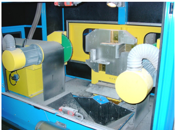
2 cuttingwheels for dry cutting

CNC cutting machine for screens. 80 screens / hour. Screen size from 210 x 300 mm up to 570 x 750 mm